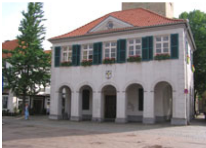
Old Town Hall

The "Old Town Hall" from the Renaissance period reminds of Dorsten's membership in the Hanseatic League and dominates the market place in the heart of the old town. Alleys and small streets lead to the market place and connect the main streets Recklinghäuser-, Essener- and Lippestraße (pedestrian zone). Parts of the old city wall and a fortification tower have been preserved.