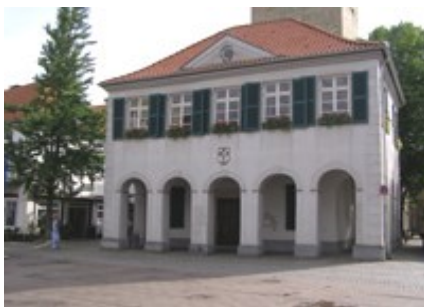
Old Town Hall

The "Old Town Hall" from the Renaissance period reminds of Dorsten's membership in the Hanseatic League and dominates the market place in the heart of the old town. Alleys and small streets lead to the market place and connect the main streets Recklinghäuser-, Essener- and Lippestraße (pedestrian zone). Parts of the old city wall and a fortification tower have been preserved.